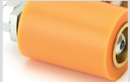
Highest quality of silicone for longlife