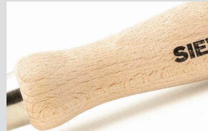
Unpainted handle for good grip and easy cleaning