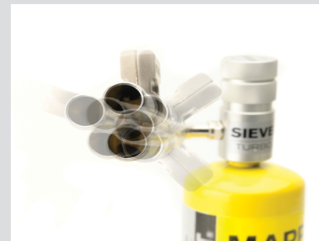
360° swivel burner for hard to reach places